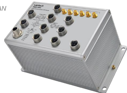
With 2 serial ports